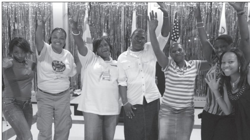
Celebrating the power of parents!