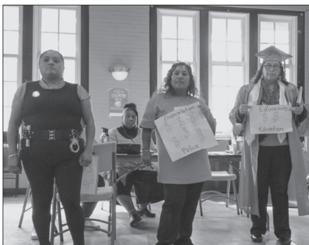
Parents engage in a street theater skit to make the point that shifting dollars from policing in schools to restorative justice and other prevention programs is a good investment in students' long term educational success.