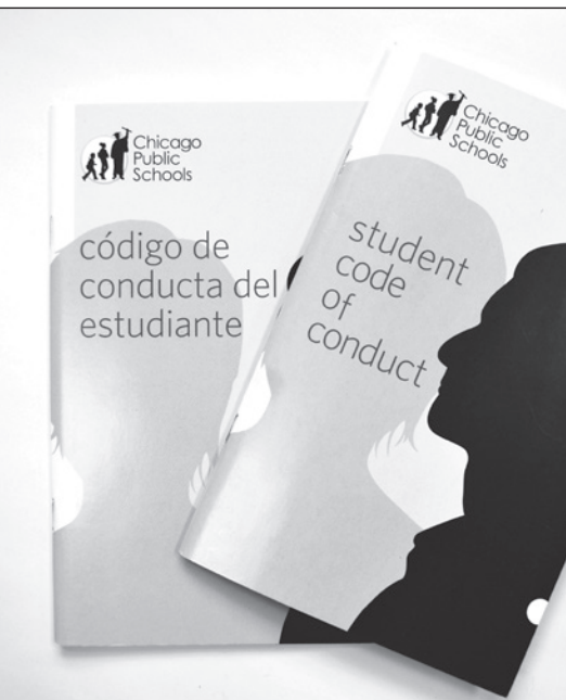
Parents can read about school discipline policies, including new restorative justice options, in the CPS Student Code of Conduct.

Since parents won changes in the Chicago Student Code of Conduct in 2007, the code now is based in a philosophy of Restorative Justice . According to CPS, “Restorative Justice is an approach to conflict that focuses on repairing harm and creating space for open communication, relationship building, healing and understanding....it is a way for those impacted by conflict to be a part of finding solutions that meet their needs and promote community safety and well-being. In a school setting, Restorative Justice Practices can help students develop the critical thinking and social skills they need to be successful throughout the school community.”