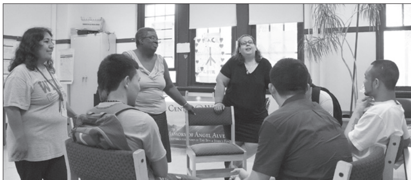
At a Parent Peace Center

The program proved successful beyond the parents’ dreams. An evaluation through an examination of grade reports, teacher check-ins, and attendance records found that 80% of the participating students showed improvements academically and the teachers reported significant changes in their behavior and attitude.