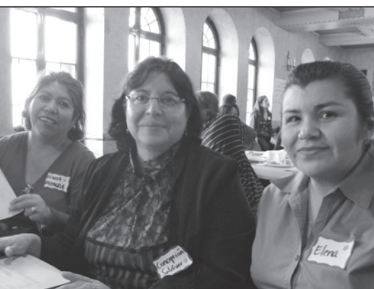
POWER-PAC leaders talked with hundreds of parents across Chicago.

We recommended the following changes in discipline policies in Chicago Public Schools. While we are still working together to achieve more, some of these recommendations are already becoming reality!